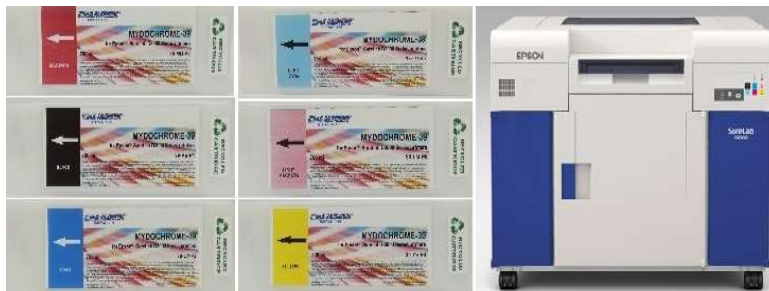
Epson Surecolor D3000 inks vs Mydoprint-39 Inks (Semi Gloss Photo Paper)